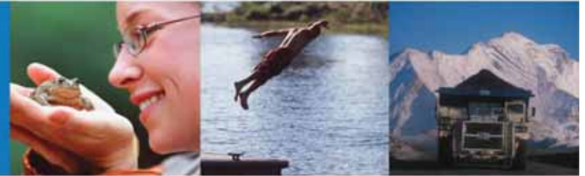
Number of Employees